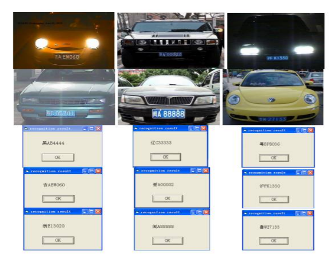
Figure 5: License Plate Recognition Experiment

A total of 300 vehicles images obtained from community entrance gates have been tested. The recognition algorithm shows a high accuracy rate of 92%. We can conclude that the license plate recognition algorithm proposed here is capable of identifying passenger car license plates against complex backgrounds.